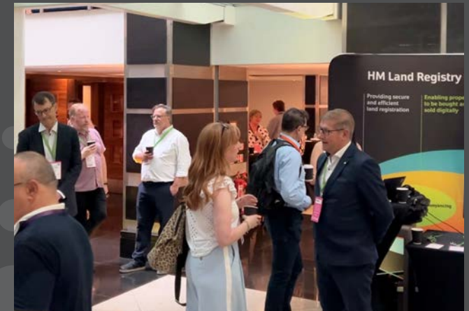
Delegates networking during a break.