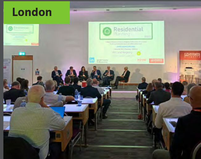
The customer team attended the Annual Residential Development Planning Conference in London