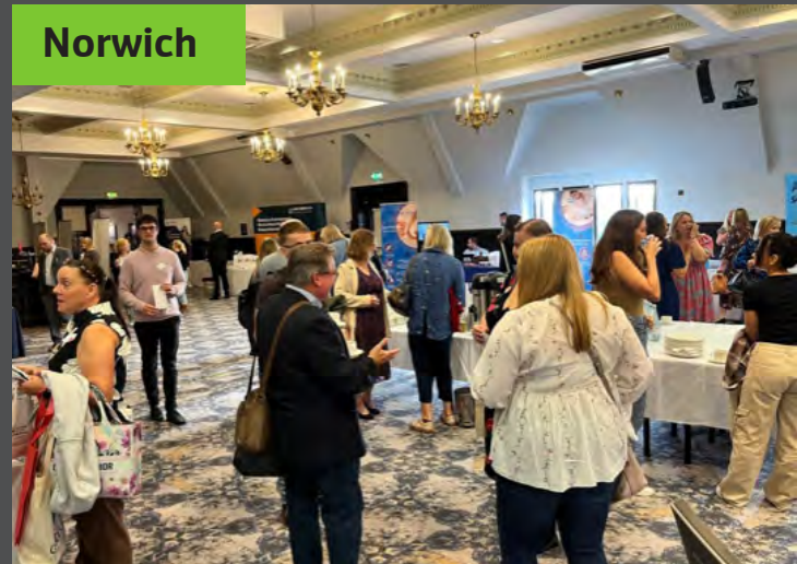
The team attended LAW2023, hosted by The Solicitors Group, in Norwich