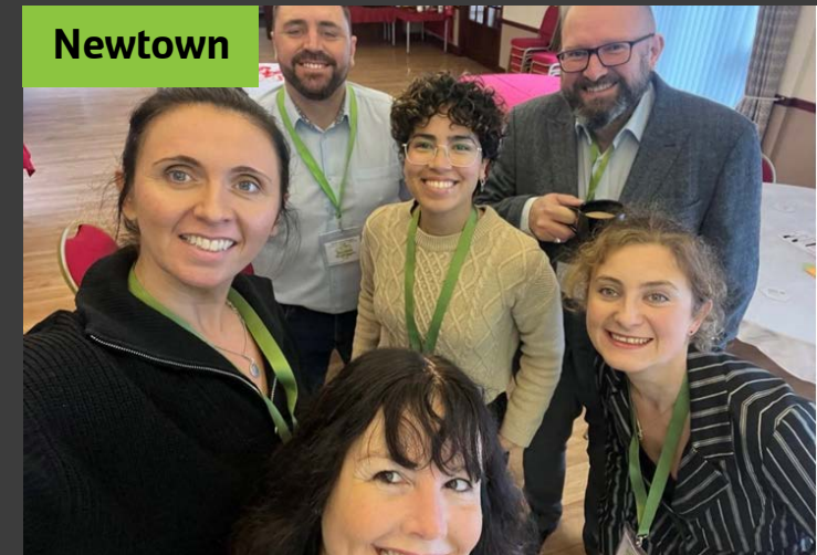
Our team in Newtown