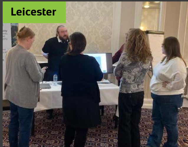
Live search service demonstration to delegates in Leicester